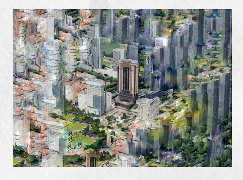
Untitled (Map of a city) image: Lu Yixin